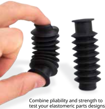
Combine pliability and strength to test your elastomeric parts designs

Accessing high fidelity, functional plastic or elastomeric prototypes has never been faster, up to 3x higher 3D printing speeds than similar class printers, and easier with finished parts up to 4x faster than other cleaning methods.