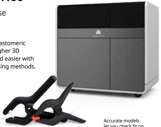
Accurate models let you check fit on complex shapes