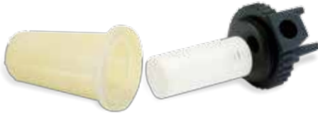
Functional filter prototype printed in clear, white and black rigid plastics