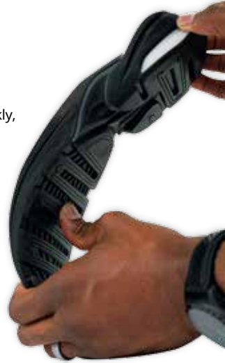
Shoe sole printed at one time in a combination of flexible black elastomer and rigid white plastic

Accurate prototypes improve communication with technicians and suppliers, reducing expensive rework. MJP is also used to make rapid tooling at a lower cost than traditional tools, jigs and fixtures.