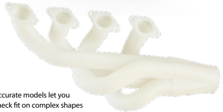
Accurate models let you check fit on complex shapes