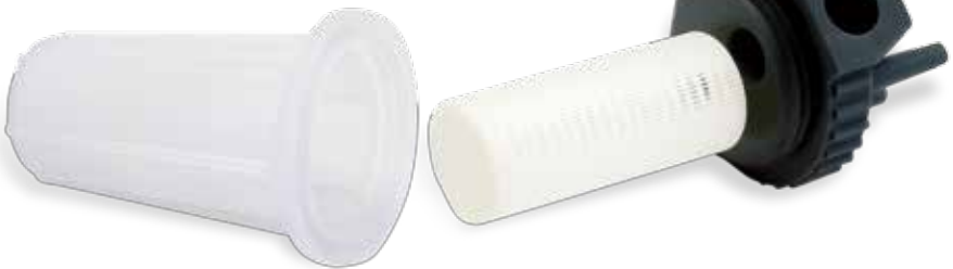
Functional filter prototype printed in clear, white and black rigid plastics